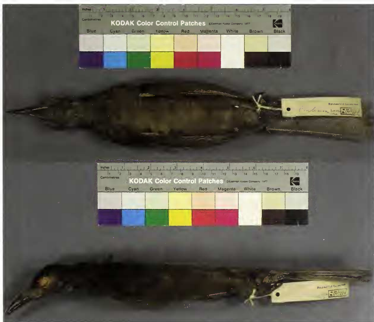
Figure 2. Ventral (top) and lateral views of AMNH 697224